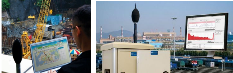
Figure 5. Screen-shot and associated equipment of ANDANTE