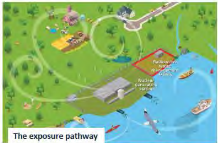
The exposure pathway

This figure illustrates a conceptual model of the environment around a generic nuclear generating station site (including a generic radioactive waste management facility) to show the relationship between releases (airborne emissions or waterborne effluent) and human and ecological receptors or exposure pathways.