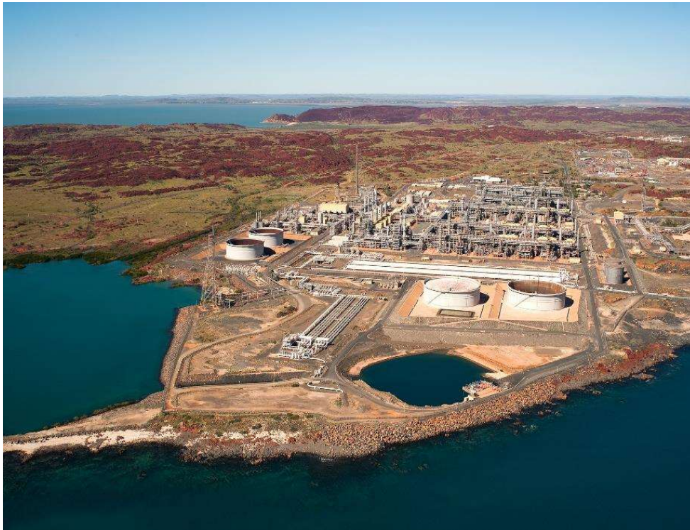
North West Shelf's Project's Karratha Gas Plant