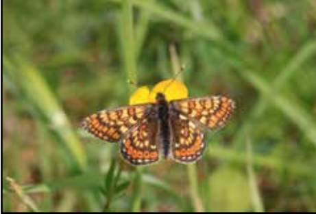
The Marsh Fritillary Butterfly, Ireland's only protected insect species under EU law.

Impact assessment practice is supporting moves toward more resolute action on the twin crises of climate change and biodiversity loss. This realignment of policy and practice involves all sectors of society. We need to protect the environment while embracing justice and social inclusion. It is clear that we all need to do more and to move faster. We need multiple Just Transitions. We need a Just Transformation.